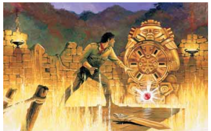
Illustration for the box of Temple Raiders, which was rejected by the board of Hasbro.